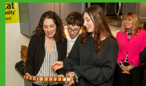
A joint dedication ceremony was held for the first three families on Cardinal Lane.

South County Habitat hired a Homeowner Services Coordinator to enhance the homeownership program and develop educational workshops.