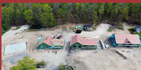
Construction began on Phase 2 of Cardinal Lane.

South County Habitat secured an $895,000 grant to purchase an 11-acre lot in Westerly. This property will be developed into 22 single-family homes for families in need.