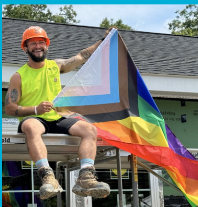
The inaugural South County Habitat Pride Build was held in June 2024.